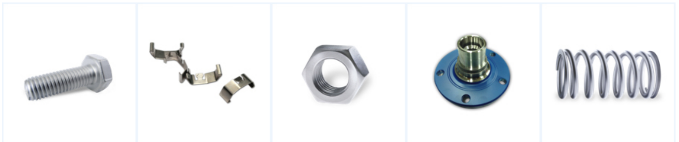
Non metrical threaded parts